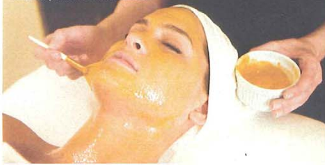
The Eve Lom Cleanser (above) kicks off a facial at Space.NK. The fruit-enzyme peel at Arcona Studio.